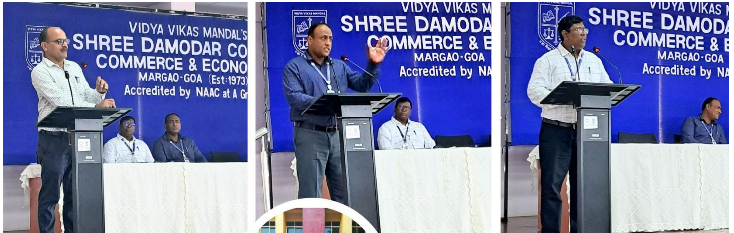
Students' Induction 2024-25

the BCA and the B.Voc.(Software Technologies) programmes. He outlined the programme structure, curriculum, and emphasized upon the importance of discipline, the do's & don'ts. He also informed about the judicious ways of using on-campus facilities and various communication media such as WhatsApp groups, email, website, and social media. He stressed the need for skills and ethics in an individual's life. He concluded by mentioning about the conduct of separate orientation sessions by various clubs and committees in next one month.